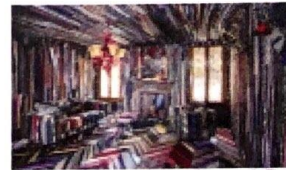
What The UK And Ireland Are Showing At The 2017 Venice Biennale