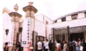
Manifesta 12 The Nomadic Biennial: What You Need To Know